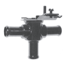
26-0043 Heater control valve 5/8" 3-way. Inlet from bottom when bracket on top*. Pull for water flow to left side.